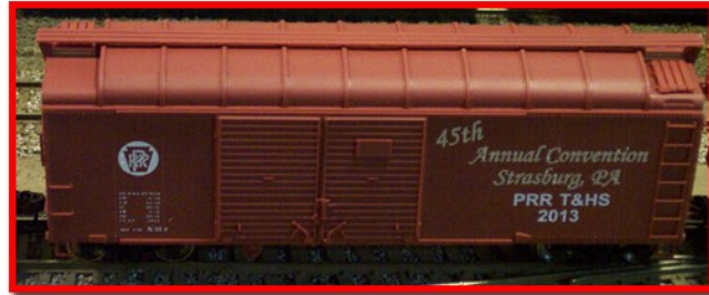
PRRT&HS 2013 Convention Car

Publications – Al Giannantonio reported that the next Keystone was in progress and that additional material is always welcome.