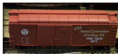
PRRT&HS Convention Car X-31F (Bowser / HO Scale)